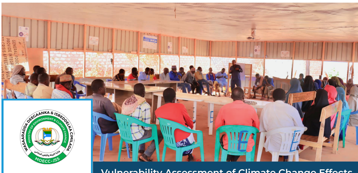
Vulnerability Assessment of Climate Change Effects on Marginalized Rural Communities in Kismayo.