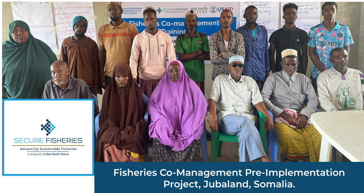
Fisheries Co-Management Pre-Implementation Project, Jubaland, Somalia.