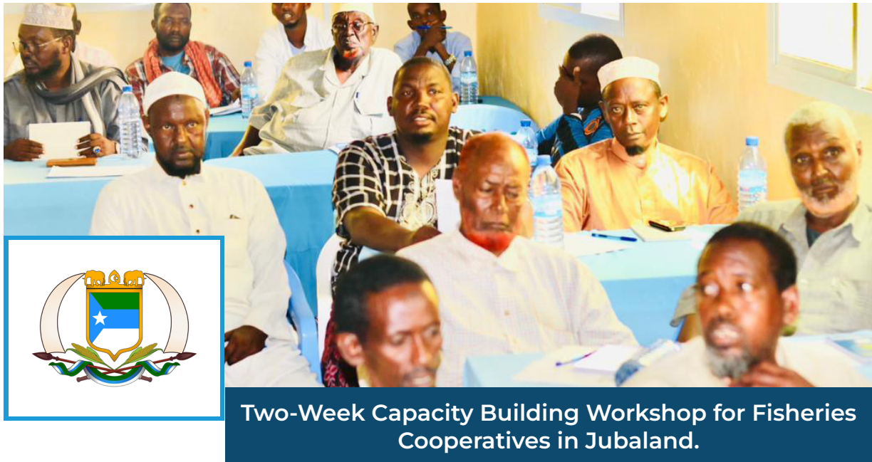
Two-Week Capacity Building Workshop for Fisheries Cooperatives in Jubaland.